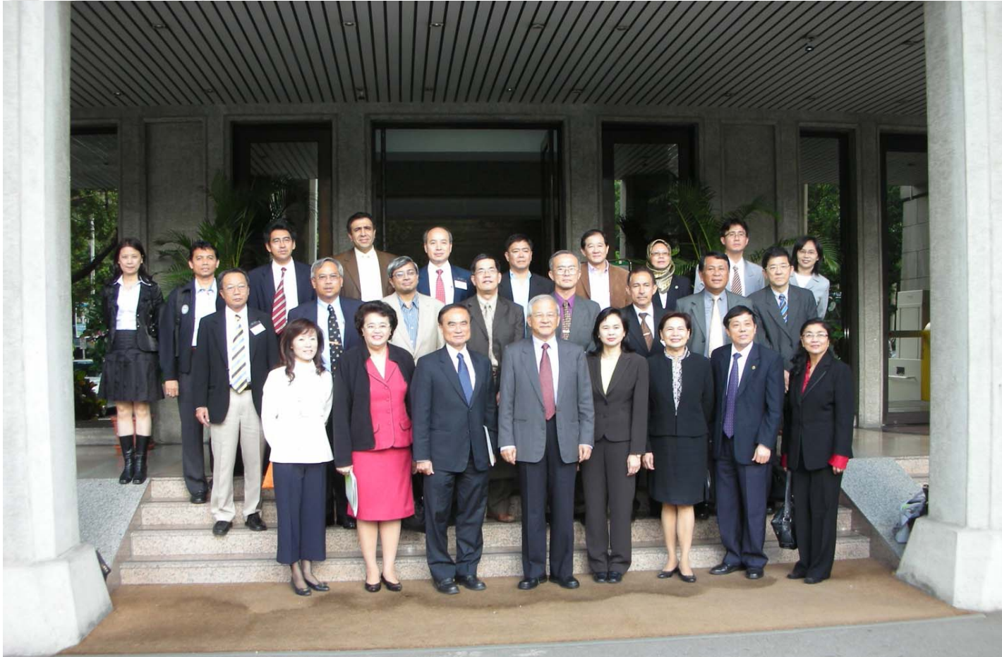
Visit to the Ministry of Education on November 12, 2008